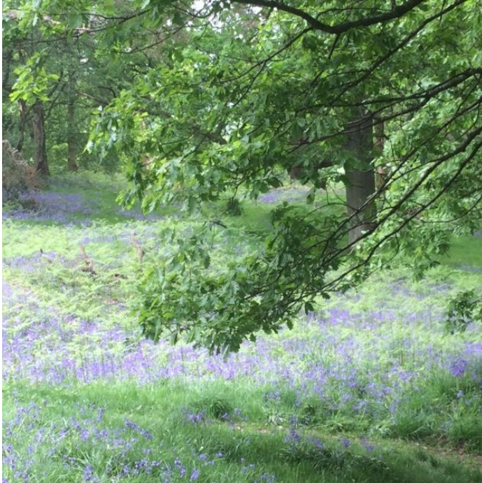
Photo: Bluebells around Castle Campbell, Dollar, Scotland